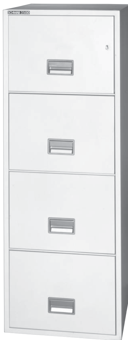
4CFD-2500: Four Drawer Vertical Legal size file. Outside Dimensions: 53 5 / 8 "H x 19 5 / 8 "W x 25"D Inside Drawer Dimensions: 10 1 / 4 "H x 15 1 / 8 "W x 20"D Approximate Shipping Weight: 383 lbs.

Schwab's Insulite™ insulation is the most efficient on the market today. Thicker insulation doesn't always mean better insulation. Insulite™ allows all Schwab files to offer features like thinner walls, lighter weight and recessed handles without compromising fire protection. This enables the Schwab design to maintain a look that is aesthetically pleasing without sacrificing its protective ability.